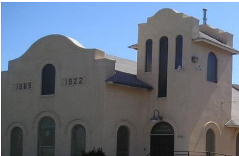
Church Membership is 242

Second Presbyterian Church is a multicultural, multi-generational congregation. Our worship is bilingual, with liturgy and music in both Spanish and English, and an English language sermon.