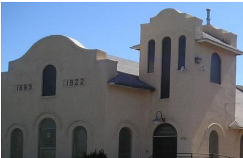
Church Membership is 243

Second Presbyterian Church is a multicultural, multi-generational congregation. Our worship is bilingual, with liturgy and music in both Spanish and English, and an English language sermon.