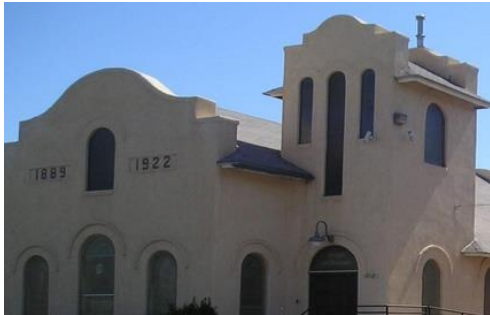
Church Membership is 249

Second Presbyterian Church is a multicultural, multi-generational congregation. Our worship is bilingual, with liturgy and music in both Spanish and English, and an English language sermon.