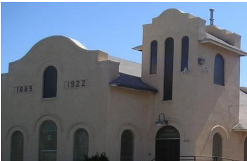
Church Membership is 249

Second Presbyterian Church is a multicultural, multi-generational congregation. Our worship is bilingual, with liturgy and music in both Spanish and English, and an English language sermon.