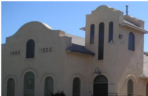
Church Membership is 248

Second Presbyterian Church is a multicultural, multi-generational congregation. Our worship is bilingual, with liturgy and music in both Spanish and English, and an English language sermon.