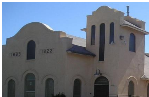
Church Membership is 242

Second Presbyterian Church is a multicultural, multi-generational congregation. Our worship is bilingual, with liturgy and music in both Spanish and English, and an English language sermon.